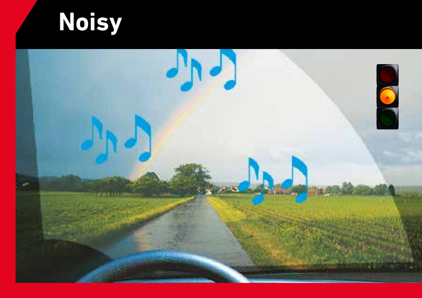
Noisy wipers may be a sign that the wiper element is deformed or hardened or that the wiper blade structure is worn. Time to replace them.

If the wiper "misses" parts of the windscreen at high speed, replace the wiper blades and check the wiper arm for damage or wear - replace if necessary.