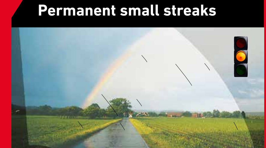
Multiple and recurring streaks in the central part of the windshield are indicators the wiper is due for replacement. We recommend you change your wipers at the next opportunity.